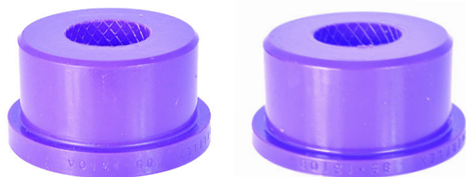
Polyurethane A Bush